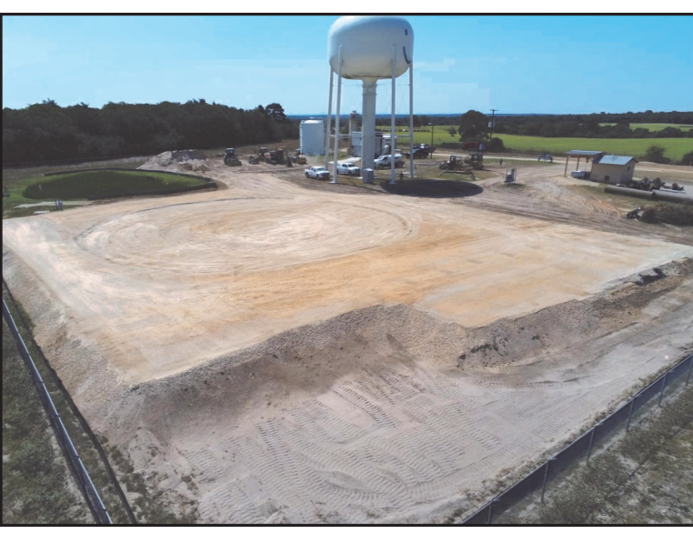
Delhi Upgrade Project; Photo courtesy of C&C Land Services LLC

As part of this ongoing capital improvement program, Aqua is currently expanding and upgrading a water treatment plant in Delhi, Texas. This project is needed to not only keep